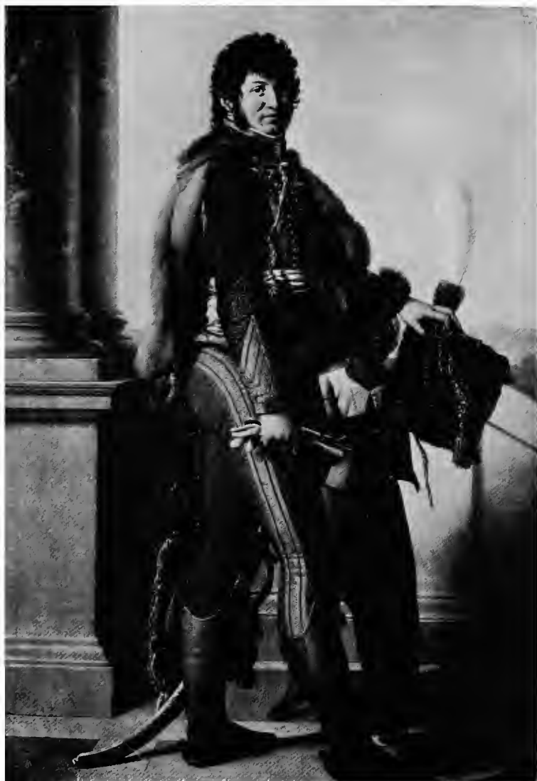
JOACHIM MURAT, AFTERWARDS KING OF NAPLES

FROM THE PAINTING BY GÉRARD AT VERSAILLES